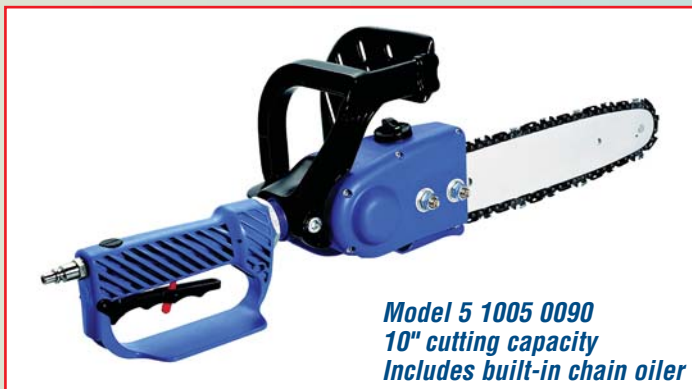
Model 5 1005 0090 10" cutting capacity Includes built-in chain oiler